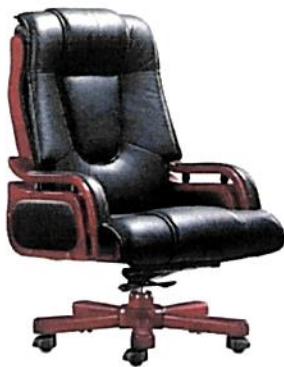
Annexure No. 6