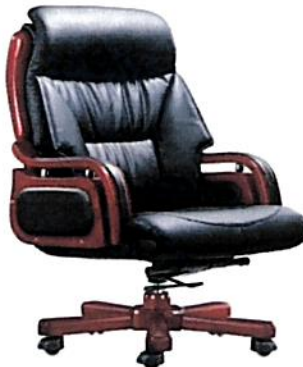
Annexure No. 7