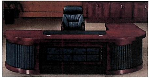
Annexure No. 2