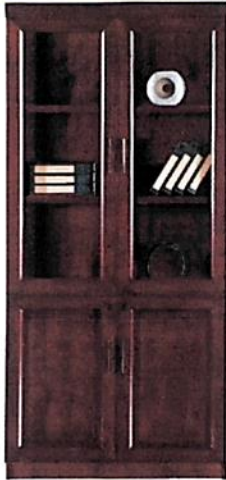
Annexure No. 3