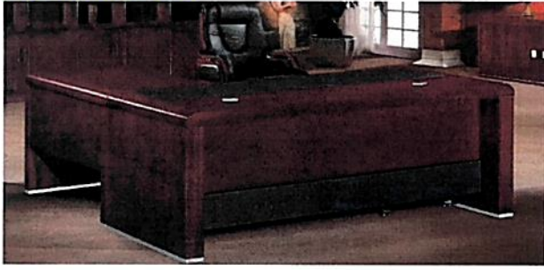
Annexure No. 1