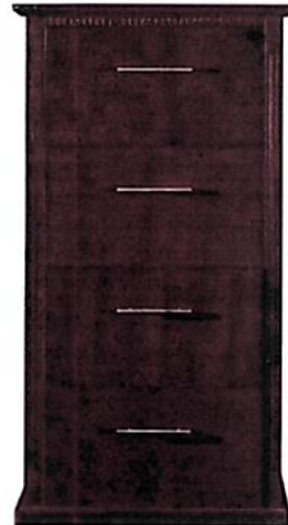
Annexure No. 5