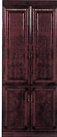
Annexure No. 4