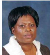
Cllr MV Phaahla Lepelle-Nkumpi Mayor