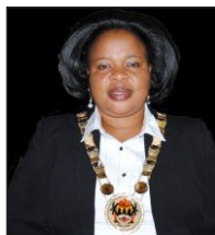
Cllr D Mmetle Greater Tzaneen Mayor