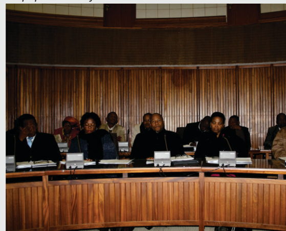
In attendance ..... Some of the traditional leaders during the sitting of the House.