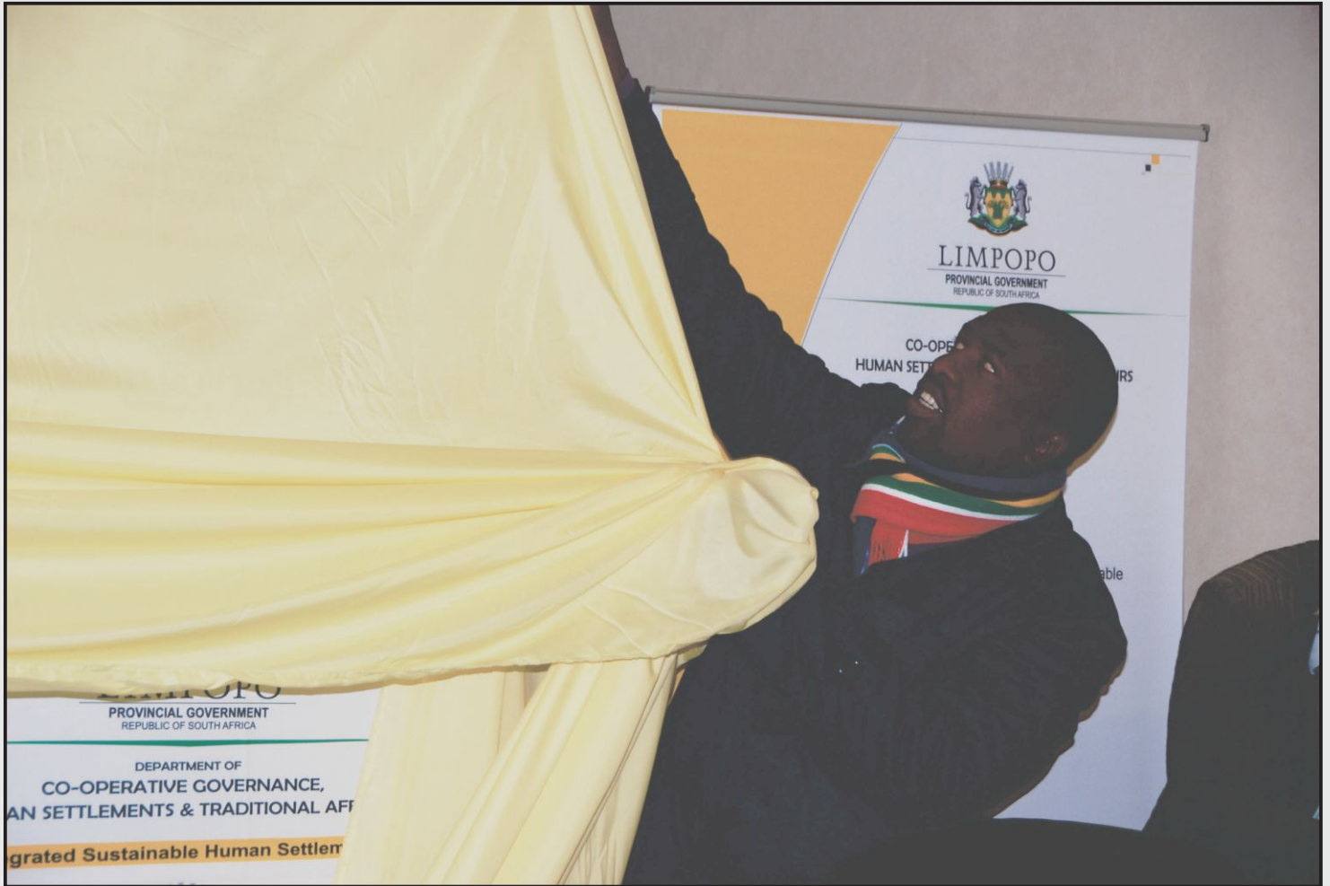
It official.....CoGHSTA MEC Soviet Lekganyane unveiling the new name to the members of the media in Polokwane.