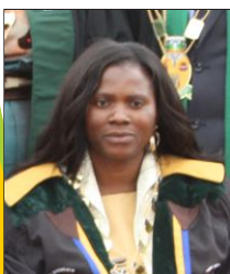
Cllr F Dzombere Vhembe Executive Mayor