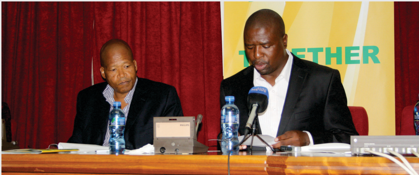
Briefing..... CoGHSTA MEC bringing the media up to speed with progress made in the first quarter on the G&A CLUSTER with Safety and Security MEC George Phadagi looking on.