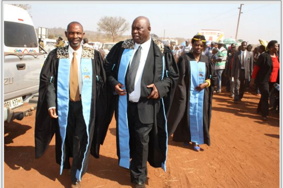
Royal strut.....Some of the Traditional Leaders who took part in the opening of the Vhembe District Local House of Traditional Leaders at Mtititi outside Malamulele.

“The Local House of Traditional Leaders is part of the system of cooperative governance which results from an acknowledgement of the diversity of the needs and concerns of the communities living under traditional laws and customs. It provides and gives right to these communities to influence the laws of the country particularly those with direct