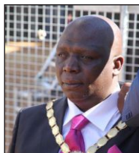
Cllr M Nkosi Greater Tubatse Mayor