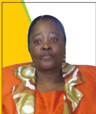
Cllr N.R. Mogotlane Waterberg Executive Mayor