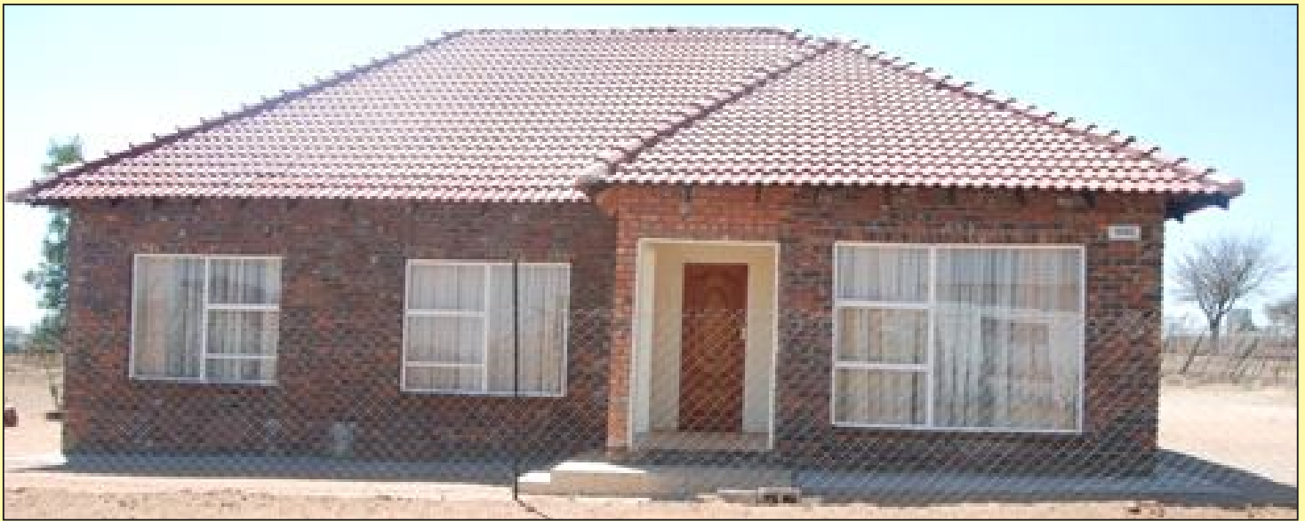
Quite habitable.....The Seabli Family proudly own this house following living in a shack for over 14 years.