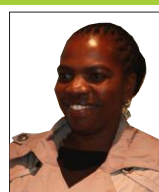
Cllr KE Lekalakala Modimolle Mayor