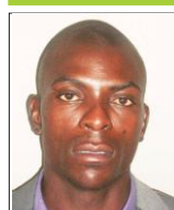
Cllr FS Hlungwane Bela-Bela Mayor