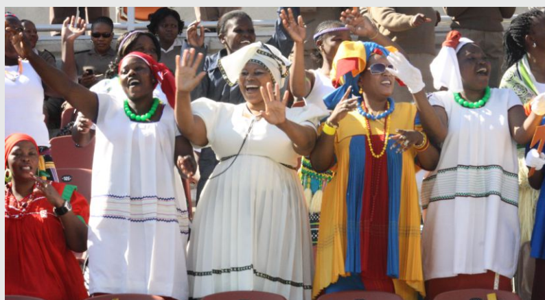
Colourful and diverse..... One of the traditional dance groups that entertained revelers during the Women's Day Celebration at Polokwane's Peter Mokaba.