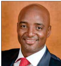
Cllr FP Greaver Polokwane Executive Mayor