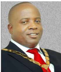
Cllr J Matlou Mopani Executive Mayor