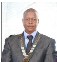
Cllr G Modjadji Greater Letaba Mayor