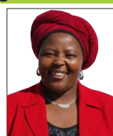
Cllr Re Mothibi Mogalakwena Mayor