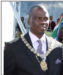
Cllr D Magabe Sekhukhune Executive Mayor