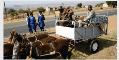
A group of people, including men in suits and women in traditional attire, walking outdoors in a rural setting. The image shows a group of people, including men in suits and women in traditional attire, walking outdoors in a rural setting. The group is diverse, with some individuals in formal wear and others in traditional clothing. They appear to be walking along a path or road, possibly during a community event or a formal procession. The background shows a rural landscape with trees and a clear sky.