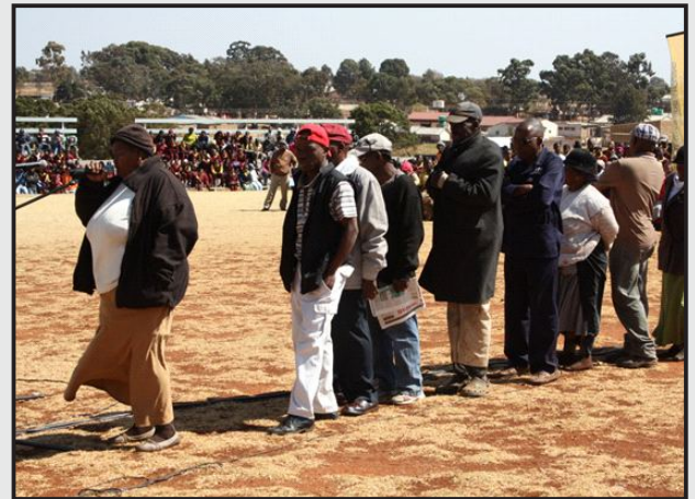
Raising concerns..... Members of the public asking questions on service delivery and complimenting the department for a job well done.