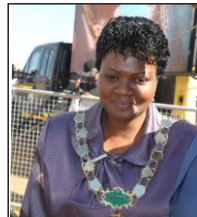
Cllr Y Mankola Ephram Mogale Mayor