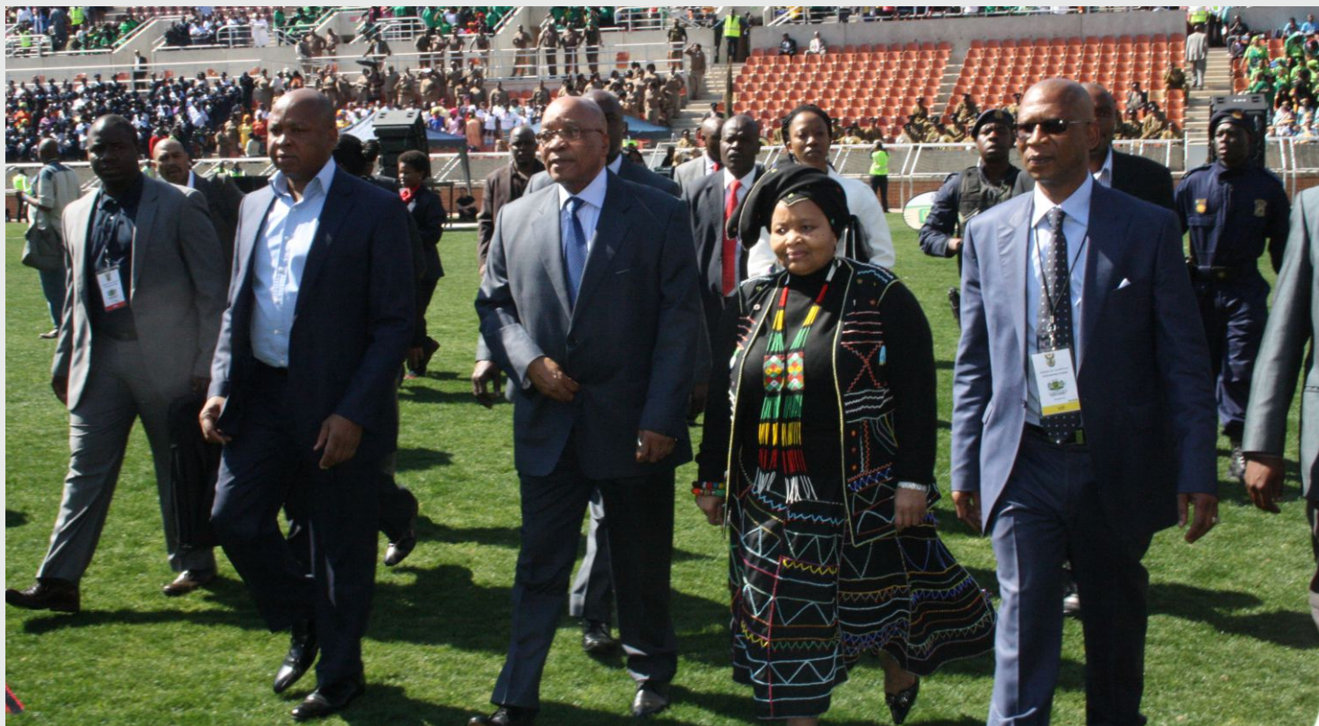
Grand entrance..... President Jacob Zuma (second from left) at the recent Women's Day celebration accompanied by Premier Cassel Mathale(left) Minister Lulu Xingwana at Peter Mokaba Stadium, Polokwane.