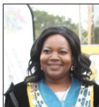
Cllr M Luruli Makhado Mayor